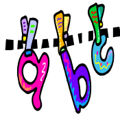
Phonics and writing